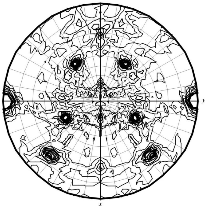
Figure 2 Self-rotation function, \kappa = 180^\circ section. The figure was produced using the program MOLREP (Collaborative Computational Project, Number 4, 1994).

was not required for successful LysA crystallization, which is in contrast to the findings reported by Gokulan et al. (2003), who only managed to crystallize LysA in the presence of lysine. Moreover, if crystallization was attempted in the presence of lysine, only poorly diffracting crystals ( d_{\min} = 6 \text{ \AA} or less) were obtained. Despite the fact that the crystallization conditions resemble very much those reported by Gokulan et al. (2003), the space group and unit-cell parameters are very different and seemingly unrelated (Table 1). The reason for this is probably the longer C-terminal extension and the extra Ala residue at position 2 of the polypeptide chain construct used in this study. The crystals also do not exhibit a distinctly yellow colour; it is therefore likely that the apoprotein has been crystallized.