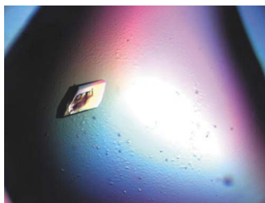
© 2005 International Union of Crystallography All rights reserved

Genomic DNA from the H37Rv strain of M. tuberculosis was used as the template for the polymerase chain reaction. The following oligonucleotides (Invitrogen) were used as forward and reverse primers, respectively: 5'-GGGG CATATGGCT GTGAACGAGCTG-CTGCACTTAGCGCCGAATGTGTGG-3' and 5'-GGGG AAG-CTT ACCTCGTGGTACACCCCTCACTTCCAAACTCAGCAAATCGTTCGACCGTCTCCC-3'. In the forward primer the GCT triplet coding for Ala (underlined) was introduced as the second codon to